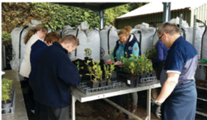
Course volunteers working at the potting station

www.rhs.org.uk/education-learning/qualifications-and-training