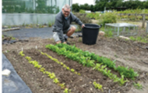
Course in action. From the top: sowing seed, setting a garden line, weeding the plot.